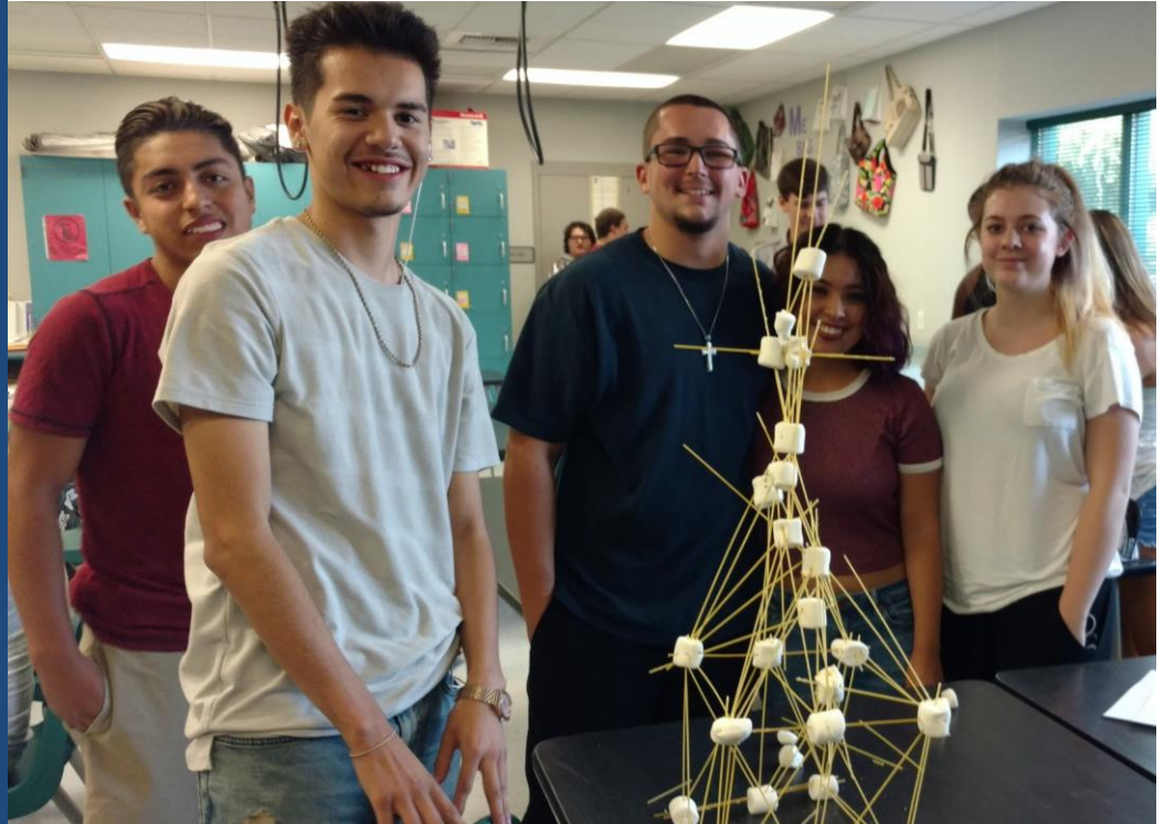
Team Building at Sultana High School, Region 10

(Schedule through end of 2016. See HECT website for next year's schedule)