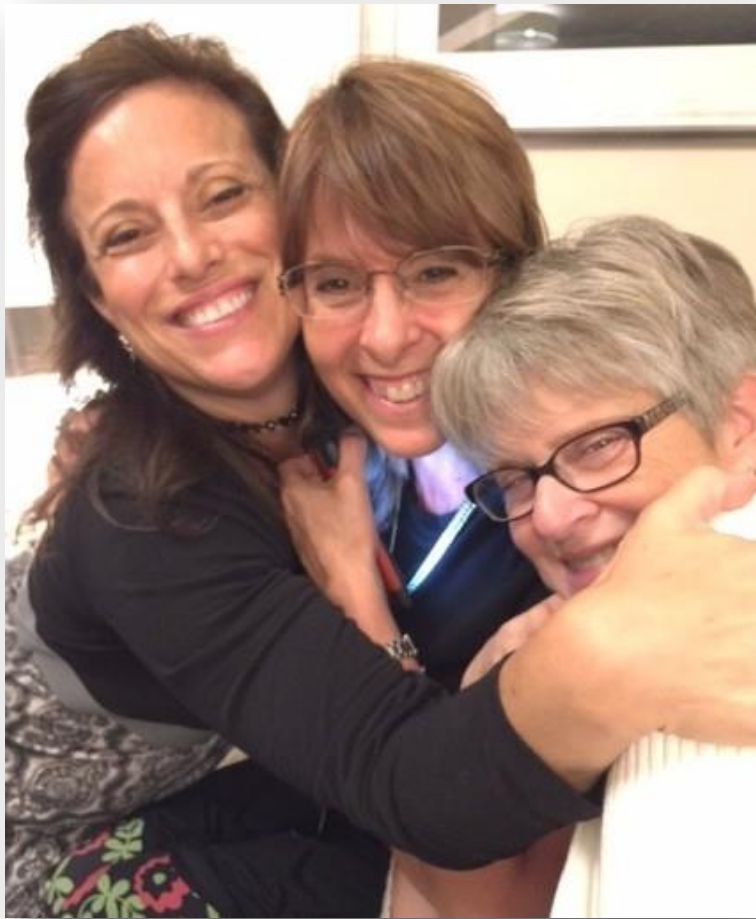
Leadership and Management Conference, Garden Grove