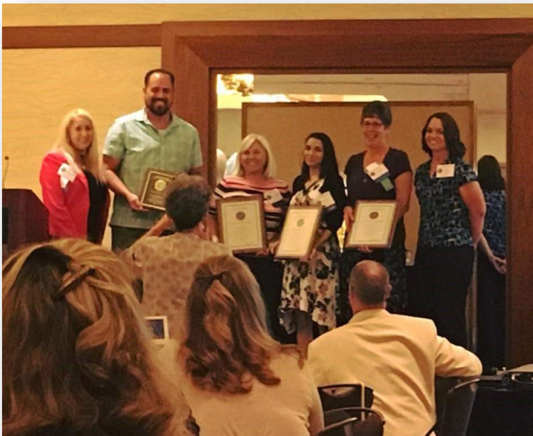
Program of Excellence winners from Sultana High School